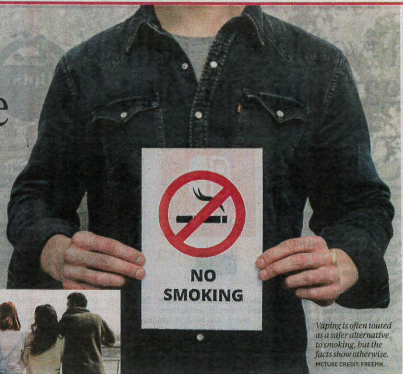
Vaping is often touted as a safer alternative to smoking, but the facts show otherwise.

I N recent years, the rise of vaping and e-cigarettes has created a new frontier in the battle against smoking.