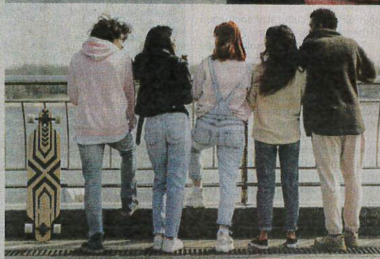
The shift from cigarettes to vaping among young people comes with its other consequences.

While it may eliminate some harmful combustion byproducts, it does introduce a new array of chemicals, including various unregulated chemicals from questionable sources, ranging from cleaning agents to pesticides and even methanol, one of