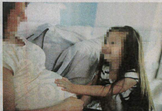
Children and pregnant women are particularly vulnerable to the effects of secondhand smoke.

Those who want to quit should consult their doctor who can help tailor a cessation plan that best suits their needs and improves their chances of long-term success.